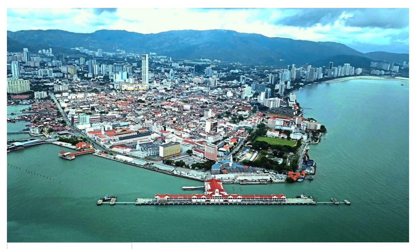
An aerial view of Swettenham Pier.

"We are unlocking the land bank with the RM155mil SPCT expansion (set to commence in the first quarter of next year) and the warehouse development, which has been given to a private company.